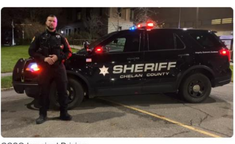
CCSO Impaired Driving