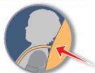
FORWARD-FACING position harness straps at or ABOVE the shoulder.