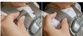
PINCHING Indicates that the strap is too loose