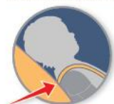
REAR-FACING position harness straps at or BELOW the shoulder.