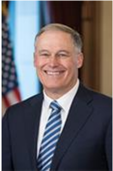
Governor Jay Inslee Commission Chair