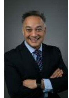
Umair Shah Department of Health