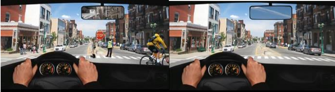
This photo shows what is actually occurring on the road.