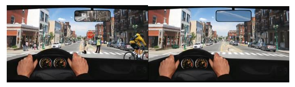
This photo shows what is actually occurring on the road.

• Cognitive distraction causes inattentional blindness , a psychological lack of attention not associated with any vision problems. Attention on something other than the road can cause an individual to fail to see something unexpected that is in plain sight.