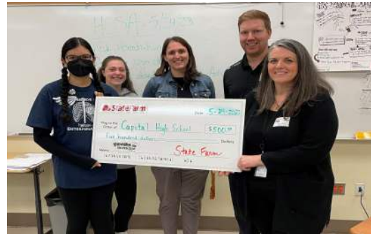
Capital High School HOSA-Future Health Professionals, Olympia, WA, receives their $500 State Farm award for completing two Teens in the Driver Seat modules.