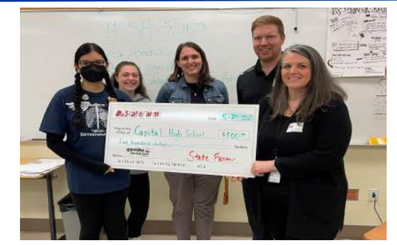
Capital High School HOSA-Future Health Professionals, Olympia, WA, receives their $500 State Farm award for completing two Teens in the Driver Seat modules.