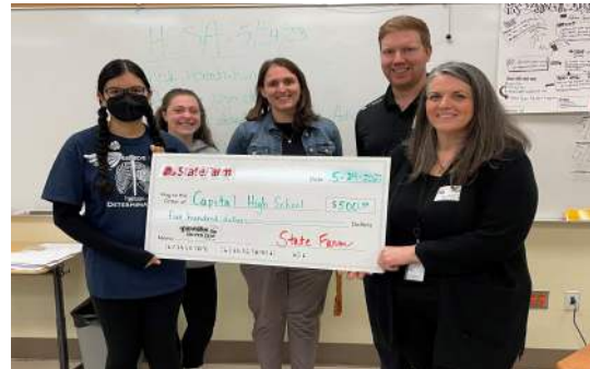
Capital High School HOSA-Future Health Professionals, Olympia, WA, receives their $500 State Farm award for completing two Teens in the Driver Seat modules.