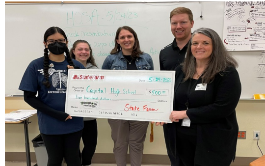
Capital High School HOSA-Future Health Professionals, Olympia, WA, receives their $500 State Farm award for completing two Teens in the Driver Seat modules.