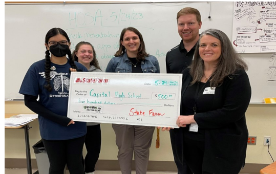
Capital High School HOSA-Future Health Professionals, Olympia, WA, receives their $500 State Farm award for completing two Teens in the Driver Seat modules.