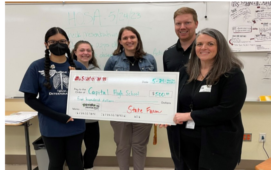
Capital High School HOSA-Future Health Professionals, Olympia, WA, receives their $500 State Farm award for completing two Teens in the Driver Seat modules.