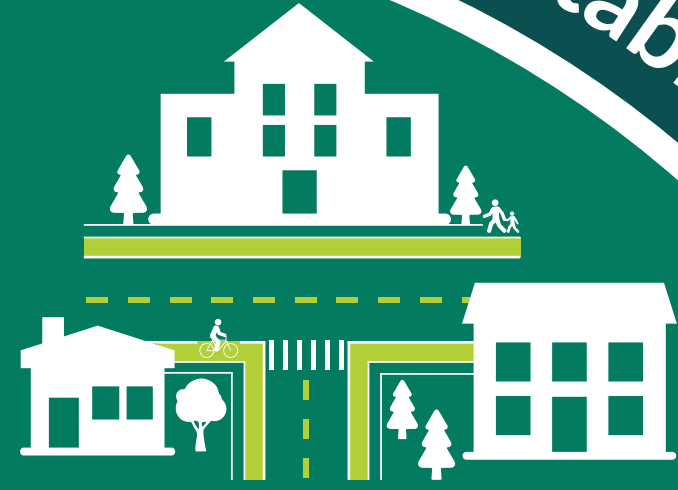
SAFER LAND USE