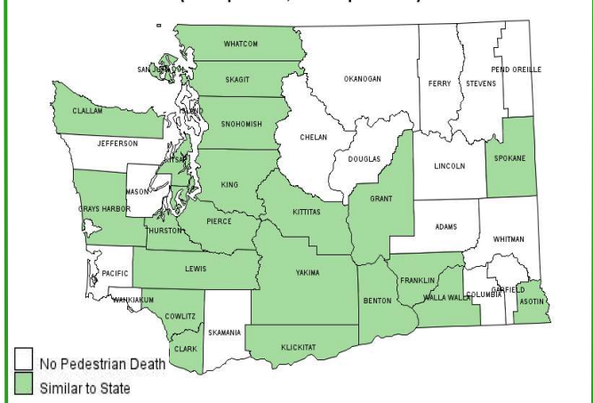
Pedestrian Deaths with Pedestrian/Driver Distraction, 2012-2016 (Rate per 100,000 Population)